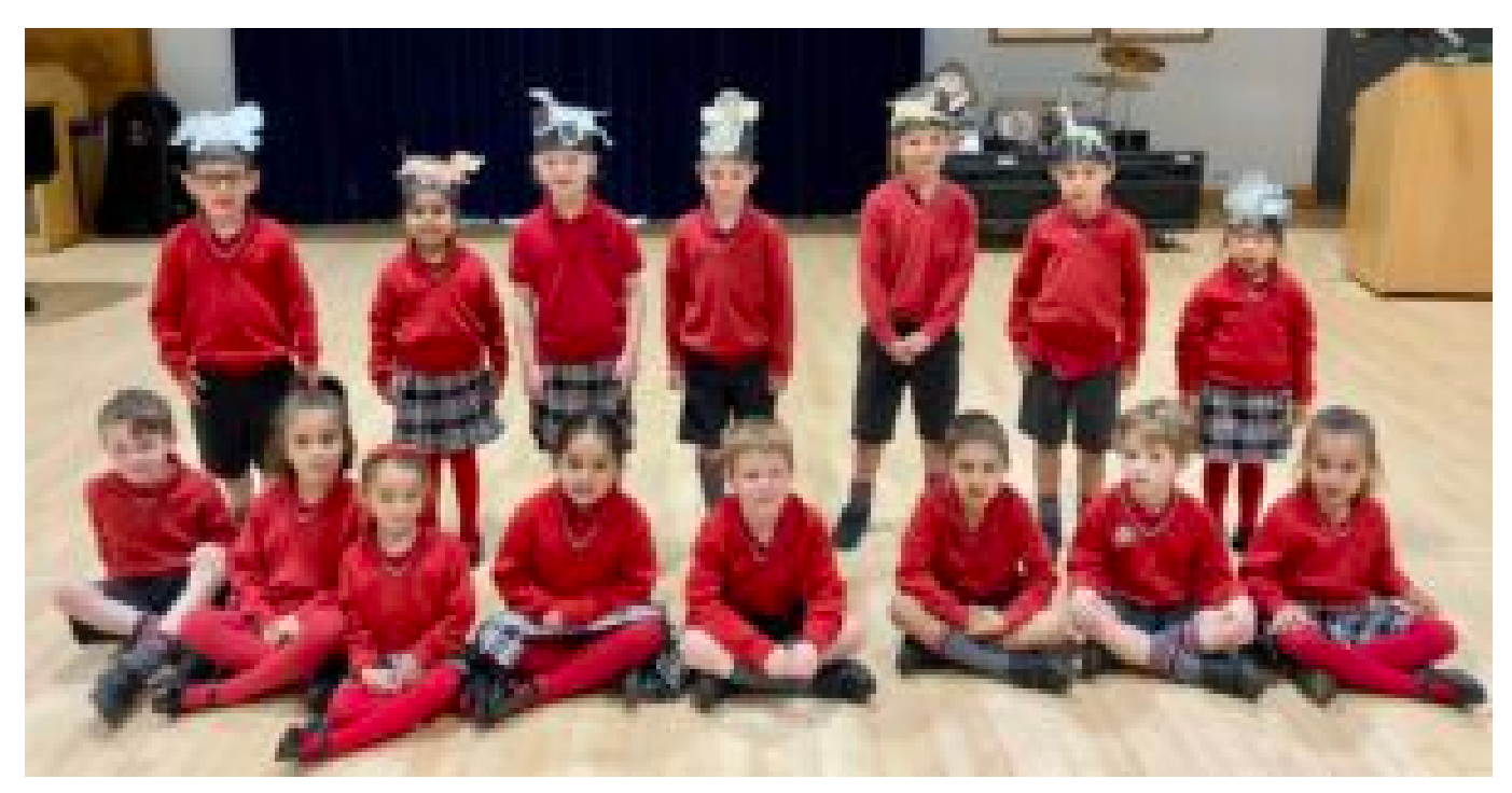
Year 2 Visit The Scott Polar Museum

We all greatly enjoyed 1CSH's assembly today where the children recited a poem, helped us to think about our place in the world and acted out the story of Hairy Maclary from Donaldson's Dairy.