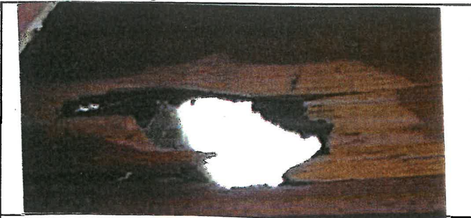
The hole that the rock made

When they were watching the news on the TV they heard a deafening crash and went to take a quick look. They had expected it to be a fallen tree or