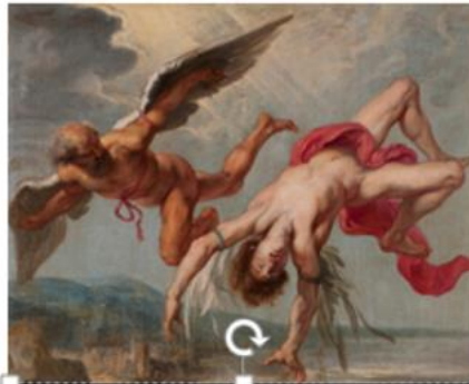
Icarus dropping into the sea and drowning. |

But the King would not let Daedalus return to the outside world. So Daedalus and his son created feathered wings. The fisherman said "It was amazing to see humans with bird like wings, but to my horror the boy dropped into the sea and died."