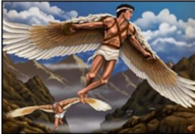
Photograph of Daedalus and Icarus leaving Crete.

Two prisoners, a boy and his father, were last seen at dawn leaving Crete, miraculously flying with wing-like shapes on their backs. It is rumoured that they were escaping from the grand palace of Minos.